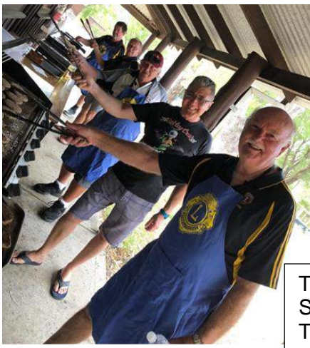
THE EATON BOYS SEQUENCE BBQ TEAM