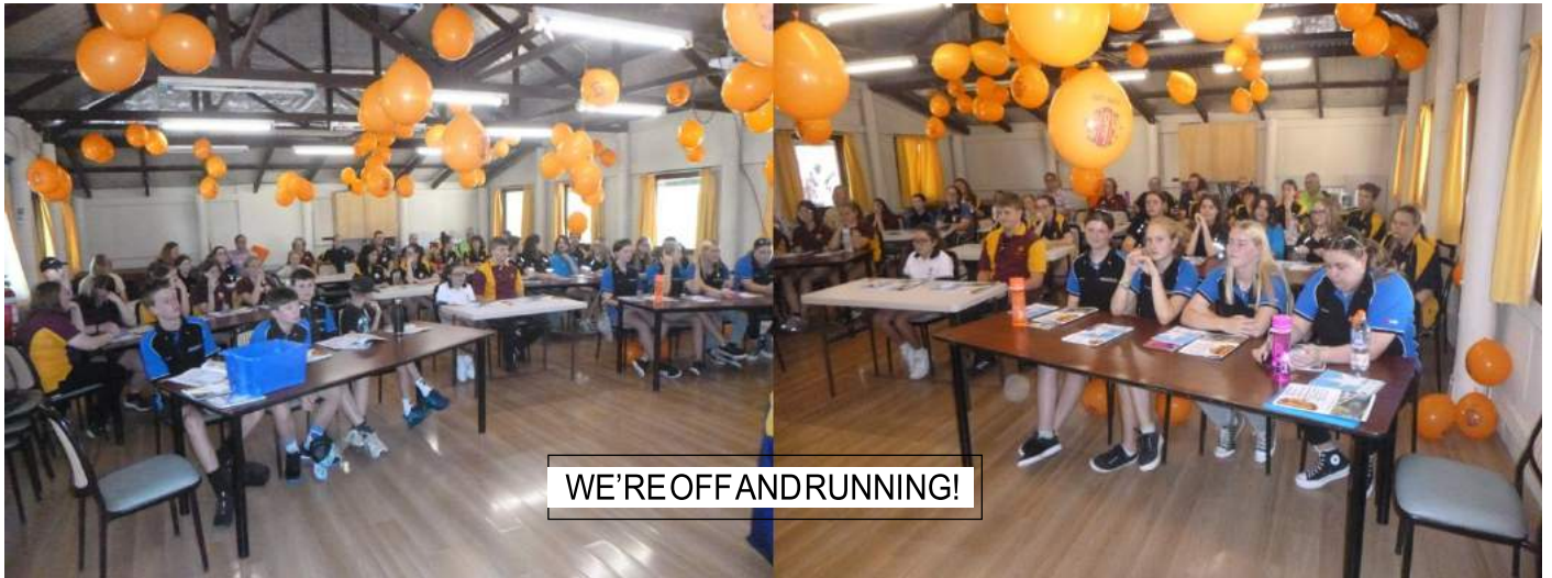
WE'RE OFF AND RUNNING!