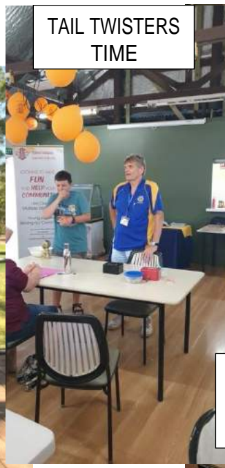
TAIL TWISTERS TIME