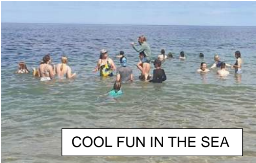
COOL FUN IN THE SEA