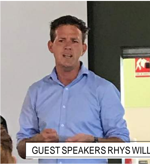
a charter member of Waroona LEO Club and now a General Service Operator (Aviation) in the Australian Army.