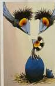
A little baby!