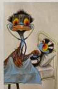
Where is my heart?