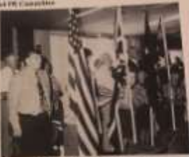
The W1 Lions Club during the opening of the mini-convention.

By the Reporter and PR Committee There were many thanks to the speakers at the... (The article reports on the success of the mini-convention.) YOUTH FORUM UPDATE An inter-club youth forum... (The article provides an update on the youth forum.)