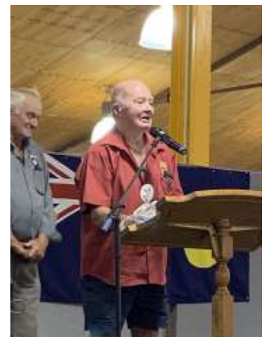
Agricultural, Cattle men, Lions .