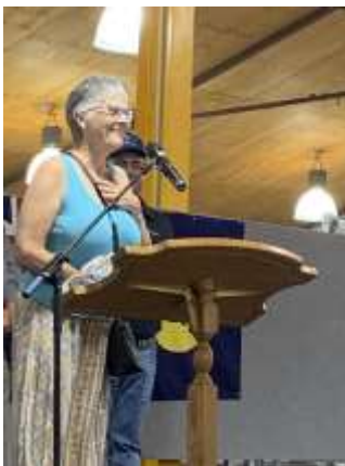
Community Service Award

The morning started by the choir, and all attending, singing the national anthem followed by a rendition of a very popular Australian bush song.