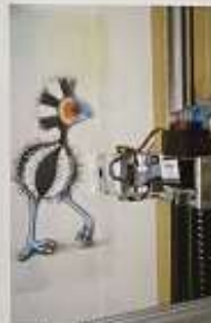
The printing equipment

It is a fantastic project well completed – we are very proud of us and it is definitely funds well spent. This will give immense pleasure and entertainment for a lot of people for many years to come.