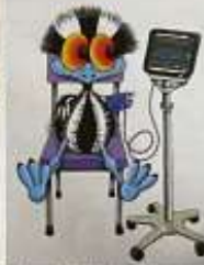
Checking the blood pressure