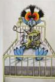
A bit of fresh air